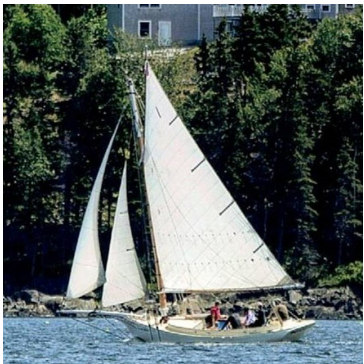
Adult sailing lessons and day sails aboard an authentic Friendship Sloop

In the meantime, our SKFF (Sail Kids For Free) program is taking off like a firecracker. Our Captain and teacher, Diane, is signing up kids from 6 to 14 years old at a phenomenal rate, BUT get this ... we are offering a very popular program of adult sailing classes as well. It has been very enthusiastically received and more reservations are coming each day. Well, by gee, the Midcoast Sailing Center is becoming a humming place. IF YOU HAVE DREAMED OF SAILING YOUR BOAT, BLISFULLY ACROSS PENOBSCOT BAY, better call up before we fill up!